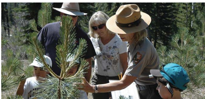
A park ranger and visitors observe pine phenology in Lassen Volcanic National Park.

Acadia National Park is working with the USA-NPN and other partners to test how best to use phenology data to identify vulnerable species, find potential temporal mismatches between species, and inform plant restoration projects.