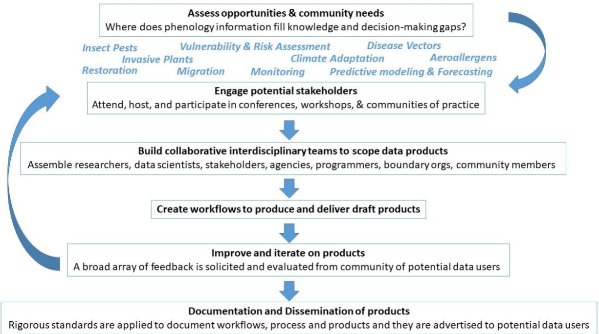
Figure 1: USA-NPN framework for developing data products that meet stakeholder needs.

The USA-NPN is currently focusing on several topical areas of management concern where relevant and timely phenological information can improve short-term decision-making and long-term planning. These topical areas include insect pests, invasive plants, aeroallergenic plants, and migratory birds. We are also working with agency partners on the topic of future changes in spring arrival as a facet of climate adaptation.